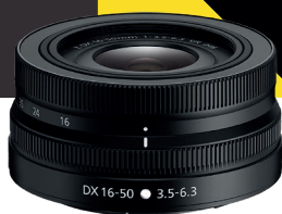
NIKKOR Z DX 16-50MM F/3.5-6.3 VR