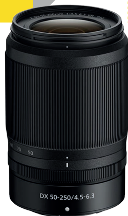
NIKKOR Z DX 50-250MM F/4.5-6.3 VR