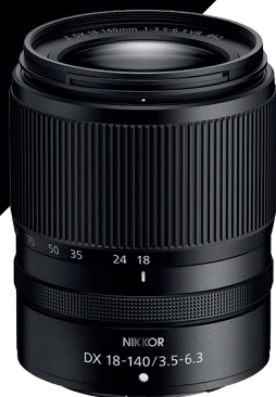
NIKKOR Z DX 18-140MM F/3.5-6.3 VR